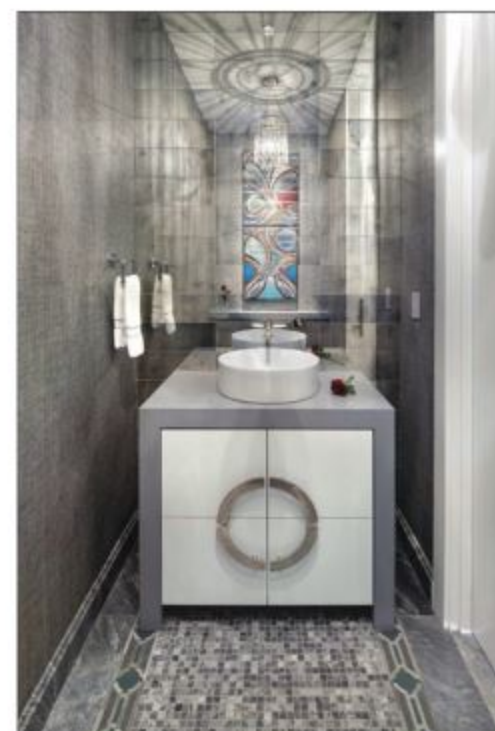
Powder Room: Second Place