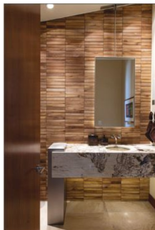
Powder Room: First Place