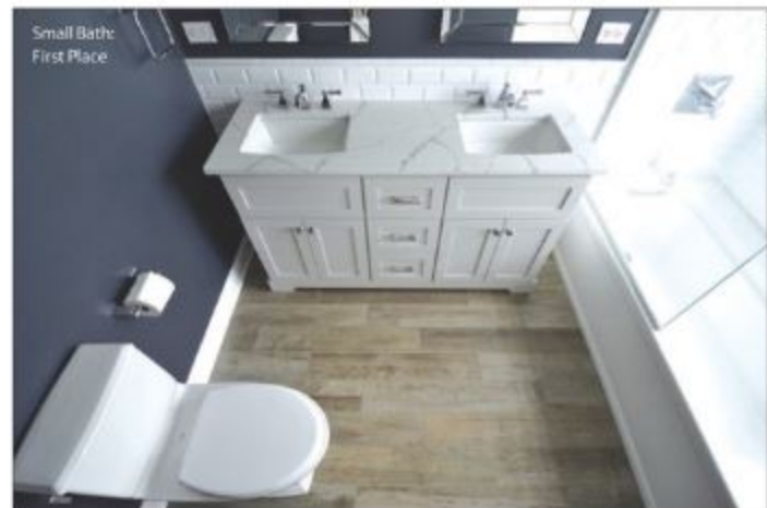
Small Bath: First Place