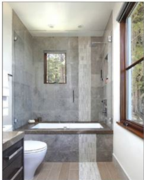
Small Bath: Second Place