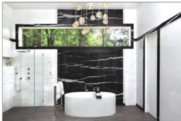
Large Bath: Third Place