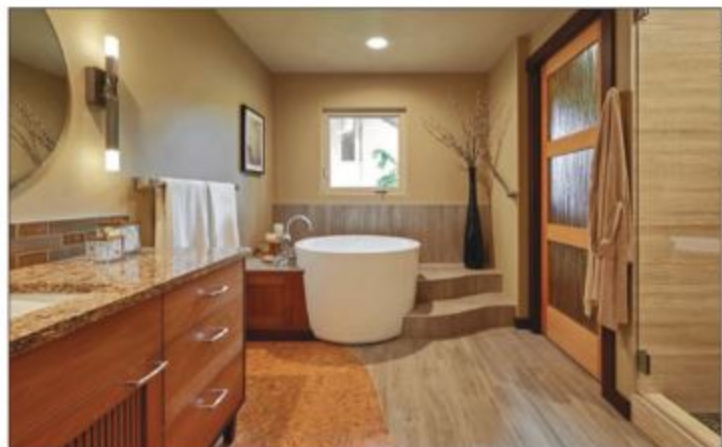
Large Bath: Second Place

Special features include eight-foot-tall panels of black-painted glass with smaller repetitions inside the toilet room; silver-backed glass tile at the vanities and in the toilet room; a cascading crystal chandelier; and textured, slip-resistant porcelain planked flooring, heated for comfort.